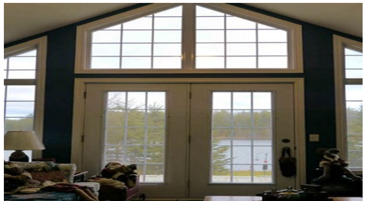
Krumpers Solar Blinds lets in warmth but keeps out cold and glair.

Call today for Bonus Coupon good for Krumpers Discount